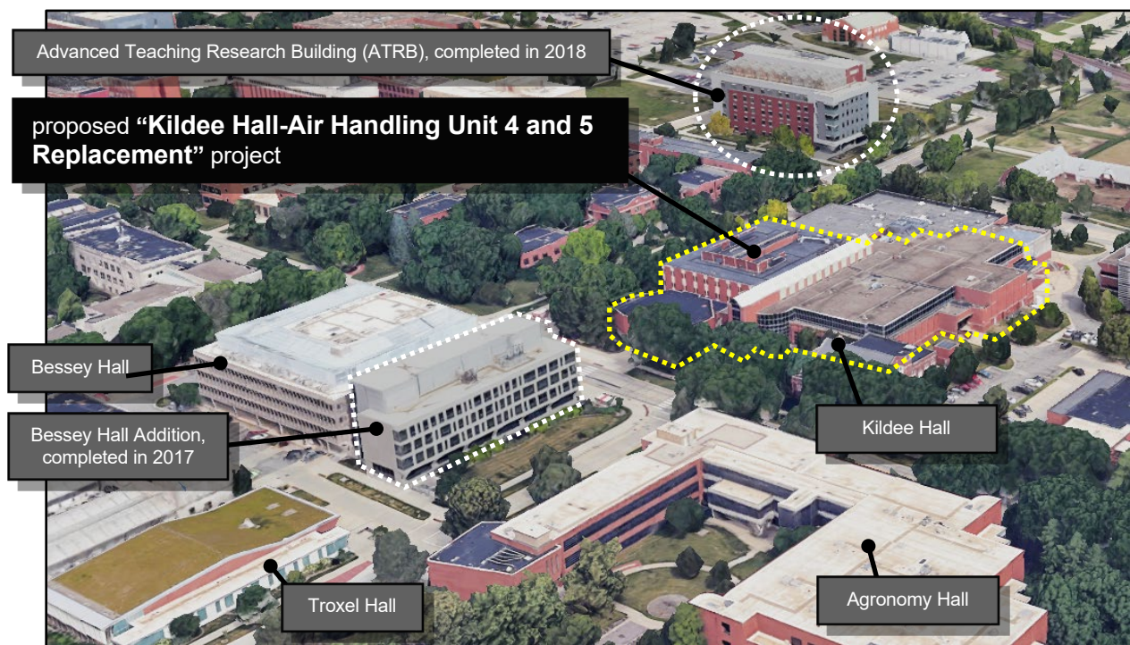
Iowa State University, northeast of central campus, looking northwest

A recent analysis of both air handling unit's heating, cooling and building control systems revealed that both were receiving a high frequency of repairs over recent years and had expensive repairs pending that could not be justified. The analysis further determined that replacement of the units would deliver the most energy-efficient and cost-effective HVAC system. New units would also increase heating and cooling reliability and enhance student, faculty and staff satisfaction.