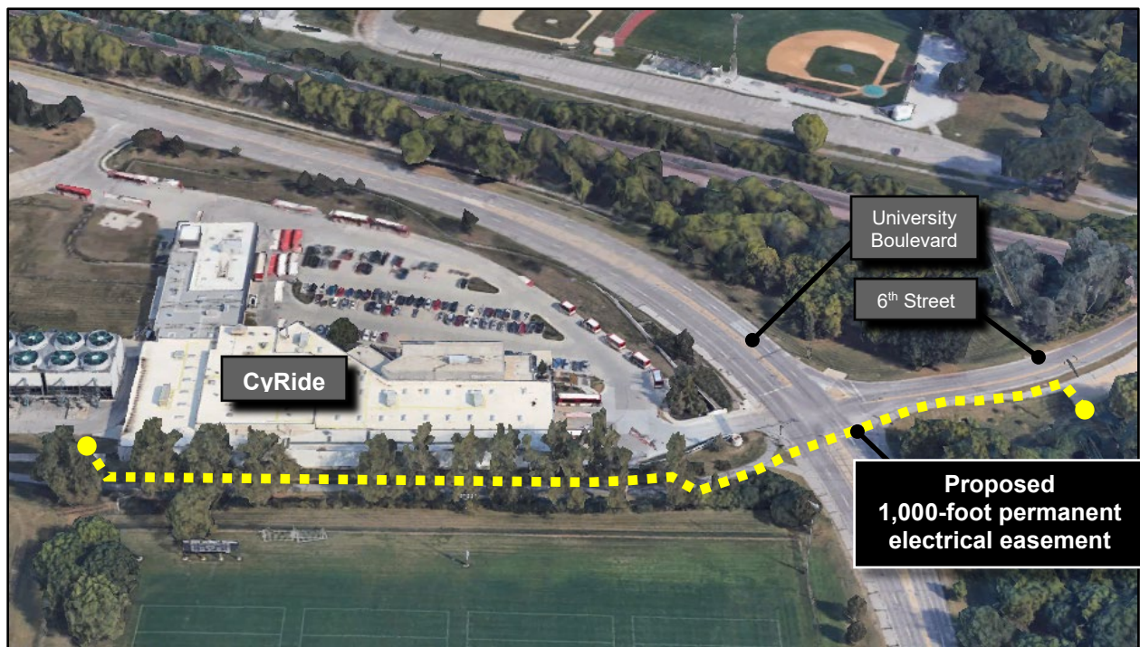
Iowa State University, northeast corner of central campus