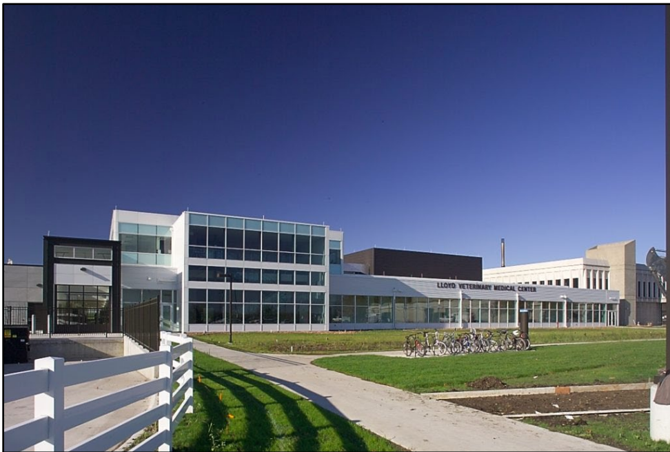
Iowa State University Lloyd Veterinary Medical Center

Background: Built in 1976, the Lloyd Veterinary Medical Center (LVMC) Large Animal Hospital would be expanded to increase large animal reproductive services in response to the growing equine community in the state of Iowa. It would enhance professional student and resident training in advanced equine sports medicine and large animal reproductive services.